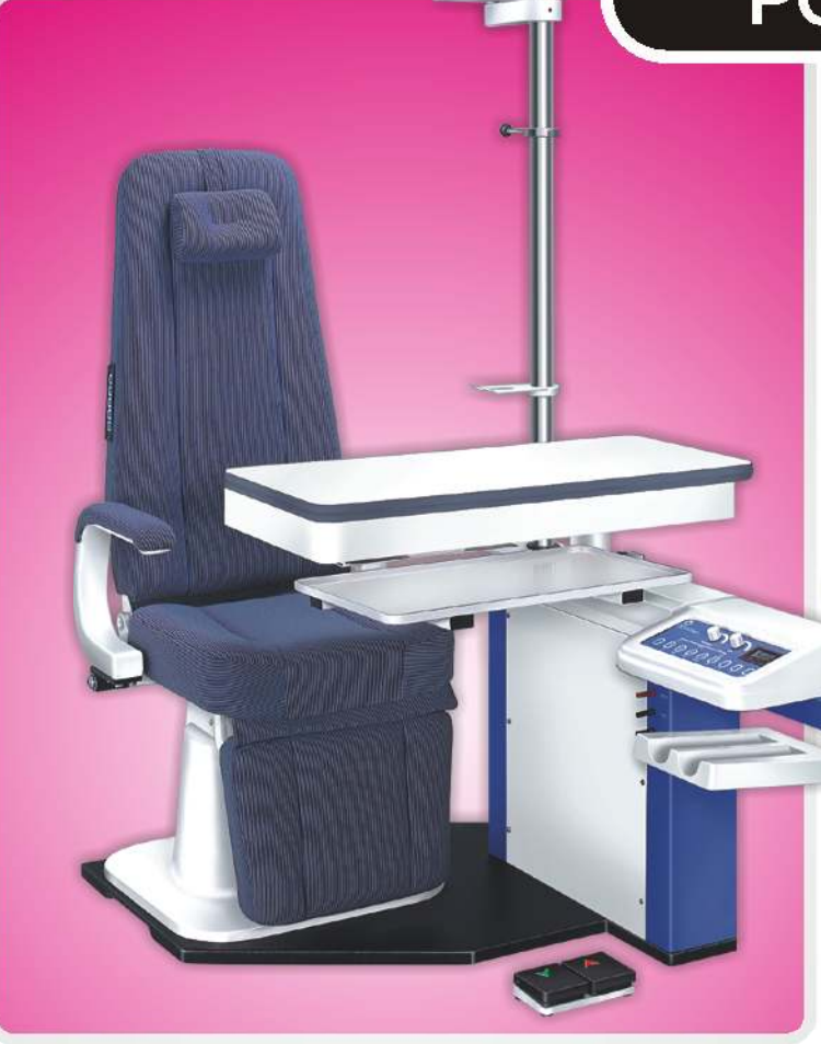
** Subject to change in design and / or specification without advance notice.